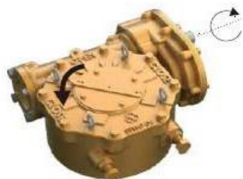
② Right Hand Input CW in- CCW out Assembly position "B"