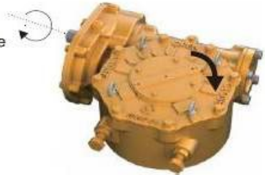
③ Left Hand Input CW in- CW out is most standard Assembly position "C"