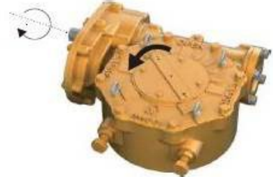
④ Left Hand Input CW in- CCW out Assembly position "D"