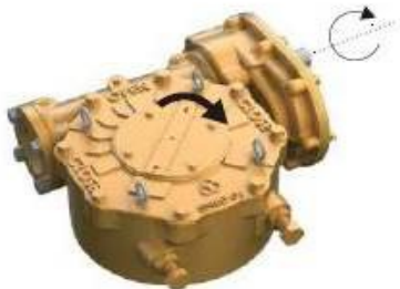
① Right Hand Input CW in- CW out is most standard Assembly position "A"